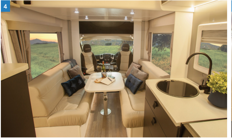
FIAT DUCATO IVECO 35C, 45C, 50C VW CRAFTER 4 MOTION